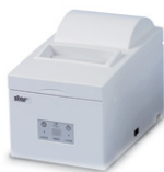
Star Printer Serial printer