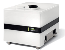
NIRMaster™ IP54 FT-NIR spectroscopy with ingress protection