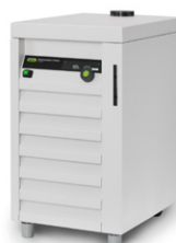
Recirculating Chiller F-305 / F-308 / F-314 The efficient and water saving way of cooling