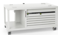
Recirculating Chiller F-325 “Support center” for the Rotavapor® R-220 Pro