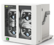
Vacuum Pump V-600 The powerful and silent vacuum source