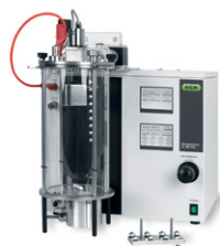
Encapsulator B-390 / B-395 Pro

Spray Dryer for small samples and particles