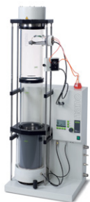
Nano Spray Dryer B-90

Spray Dryer for small samples and particles