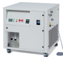
Inert Loop B-295