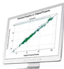
Quick-start calibrations Feed, food, milling and bakery