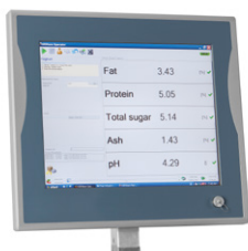
Monitor IP65 Waterproof touch-screen