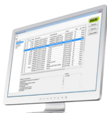
NIRAnywhere Software Network solution