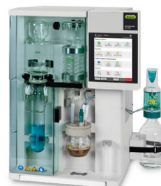
KjelMaster K-375 Steam distillation and titration