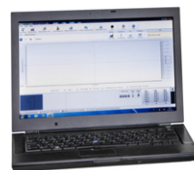
SepacoreControl Software Full control software