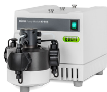
Pump Module C-601 / C-605 Pump