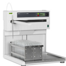
Fraction collector C-660 Fraction collection