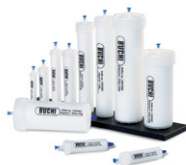
Sepacore® Flash cartridges Prepacked columns